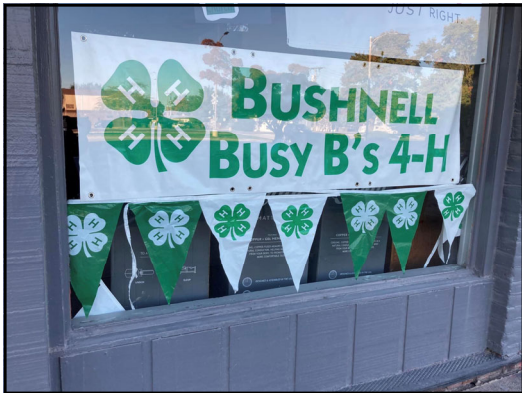
Bushnell Busy B's window display at M&B Furniture in Bushnell.