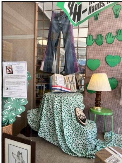
Town & County Clovers' display at New Copperfield's Bookstore in Macomb.