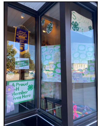
Scotland Clever Clovers display at Terrill Title in Macomb