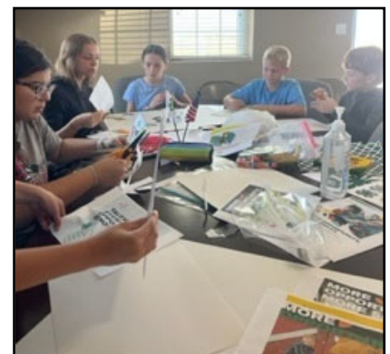
Blandinsville Blue Ribbons made 4-H flyers to place around the county.

Our 4-H clubs worked hard on their displays and showcased their creativity unfortunately not everything got photographed. We know the Cheerful Chesters made a playful display at the West Prairie South Elementary. The Active Good Hoppers passed out flyers at the West Prairie North Elementary. Scotland Clever Clovers sent handwritten thank you cards to volunteers. The 4-H Helping Hands painted pumpkins for local businesses.