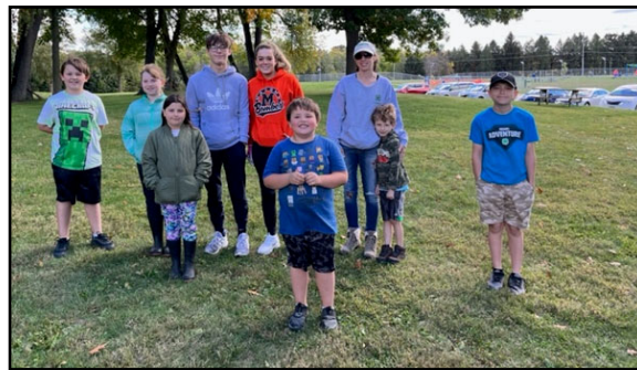
4-H members and their families helped weeded and mulch the trees we planted in April at Patton Park.