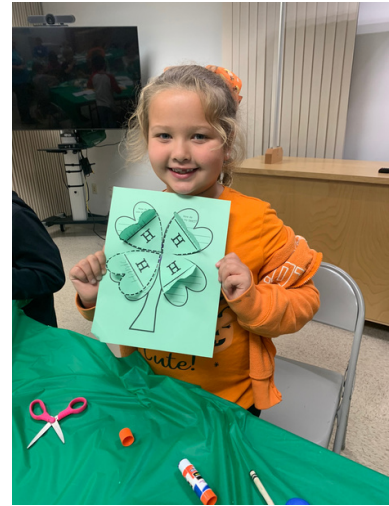
Monroe County Cloverbud members kicked off their first meeting learning about the four H's of 4-H and the significance of Head, Heart, Hands & Health.