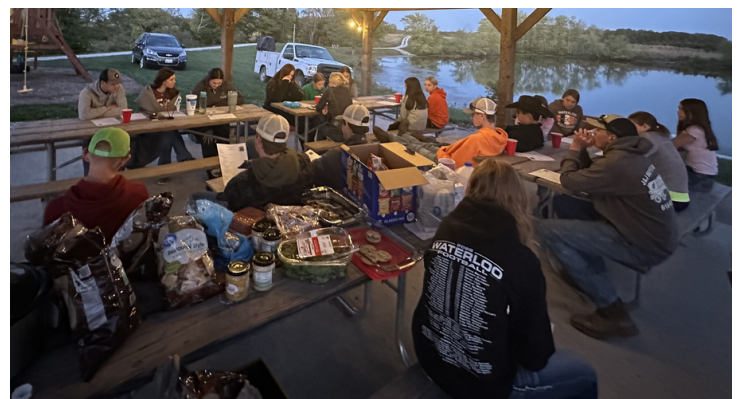
Monroe County 4-H Teen Federation recently held its New Year/New Member meeting at Baebler Educational Farm. We were happy to see so many new faces! The group also collected 148 toilet paper rolls to donate to the House of Neighborly Services.