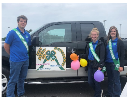
4-H Ambassador Team

The Ogle County 4-H Foundation provides support in the following ways: