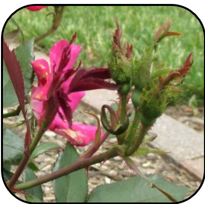
Figure 2 Symptoms on a Radrazz rose. Note the red discoloration of the new growth and the terminal witches' broom.