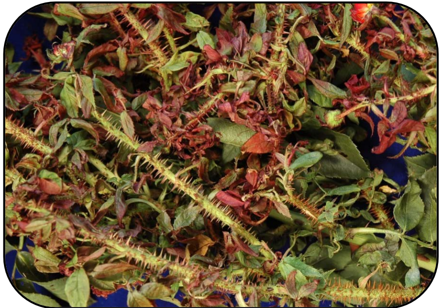
Figure 1 Symptoms of rose rosette on a rose host infected with RRV. Note the thick, succulent stems, the proliferation of small thorns, and the red color of the new growth.

In 2011 a virus named Rose Rosette Virus, or RRV, was established as the cause of rose rosette disease. Roses appear to be the only hosts for this pathogen. Unfortunately, a wide variety of rose groups including hybrid tea, floribunda, grandiflora, and miniature roses appear to be susceptible. Shrub roses, including the increasingly popular Radrazz roses (better known by their registered trademark name, the Knock Out® Rose), are also susceptible. The invasive weed, multiflora rose, is particularly susceptible to RRV. This disease has been used as a biological control of multiflora rose with varying success.