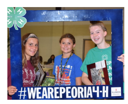
Share the 4-H Experience and FUN! Invite a friend to join 4-H

Legacy of Leadership Scholarship Livestock Scholarship