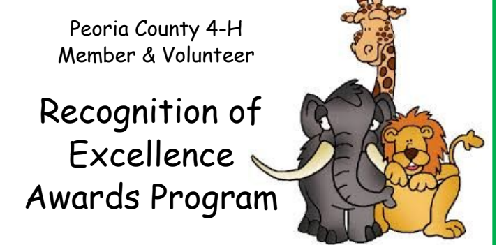
Saturday, November 9, 2019 Brimfield Evangelical Free Church Hosted by 4-H Federation