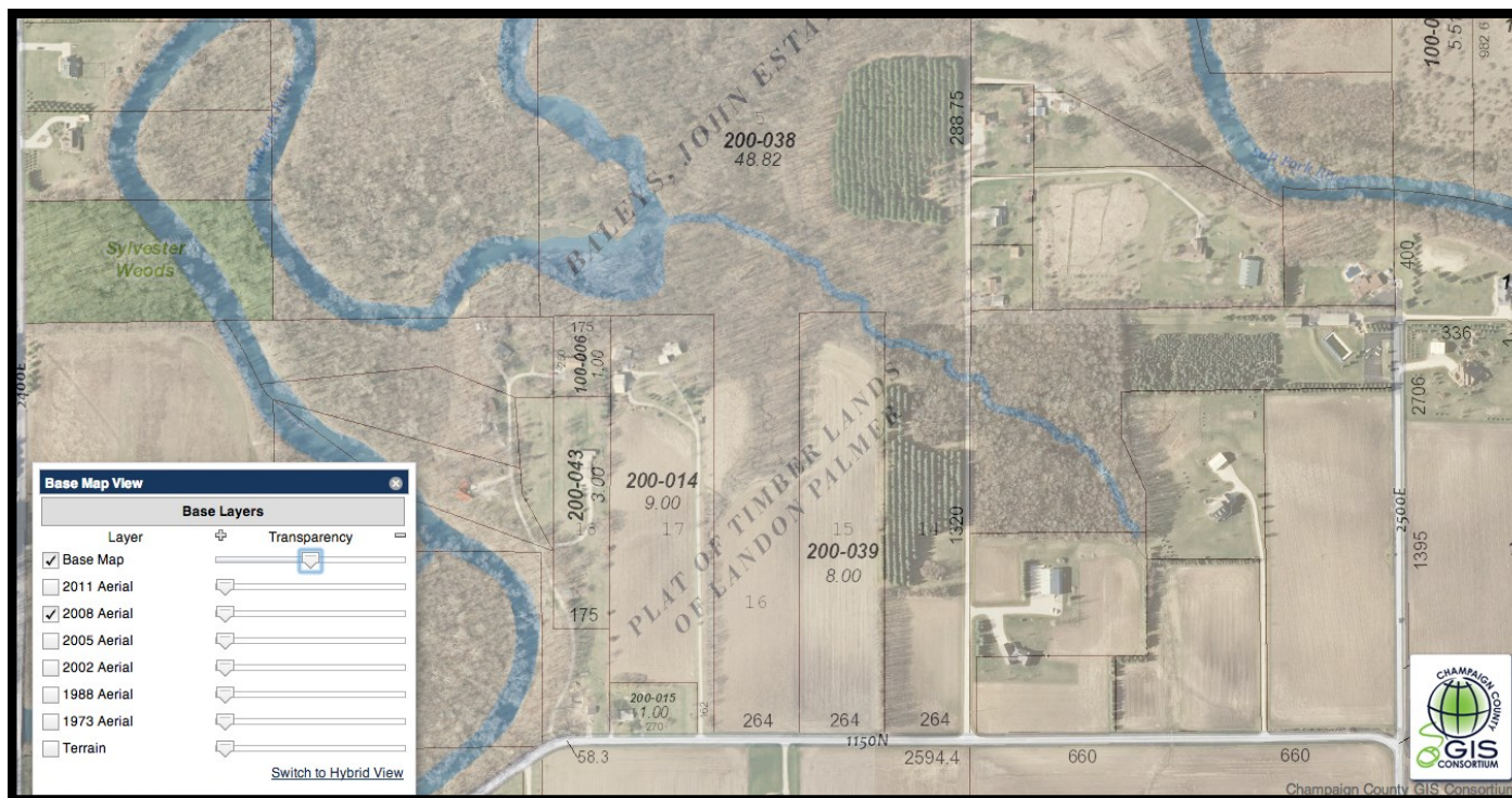
Figure 2. An example of a tax parcel map accessed directly from the Champaign County GIS Consortium website ( http://www.maps.ccgisc.org/public/ ).

Please note the Illinois County GIS Resources website is not exhaustive and it may not be completely up-to-date. Therefore, users should conduct a direct Internet search using their favorite search engine to locate a specific county GIS website. Alternatively, landowners can directly contact their county tax assessors.