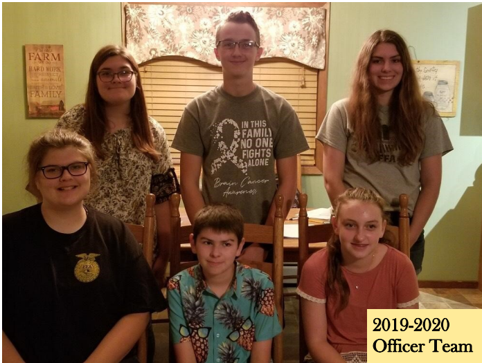
2019-2020 Officer Team