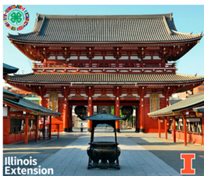
Travel Abroad Update!

Registration for the Travel abroad 2022 program will open in early September. Learn more HERE .