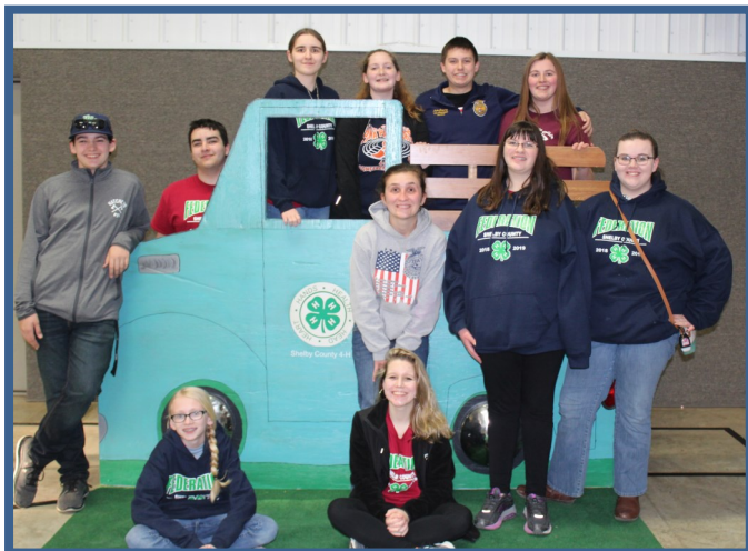
Thank you Shelby County 4-H Federation for all your help during Shelby County 4-H Week!