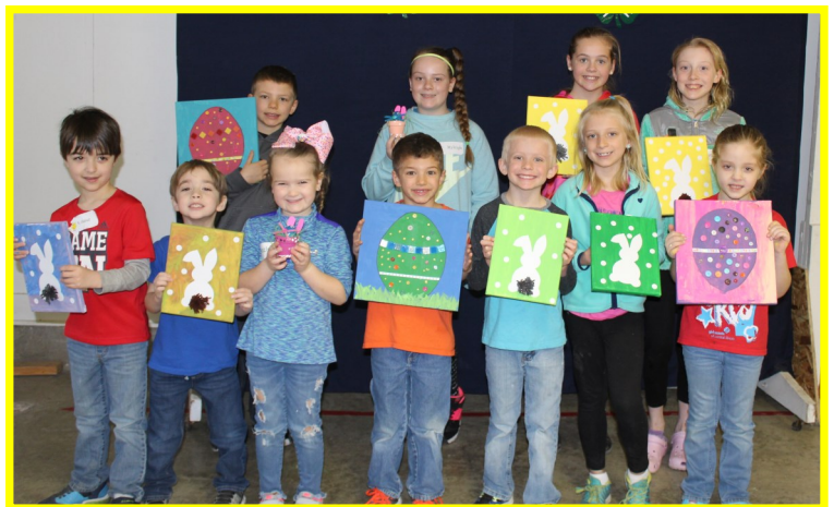
Spring Craft Day Fun!