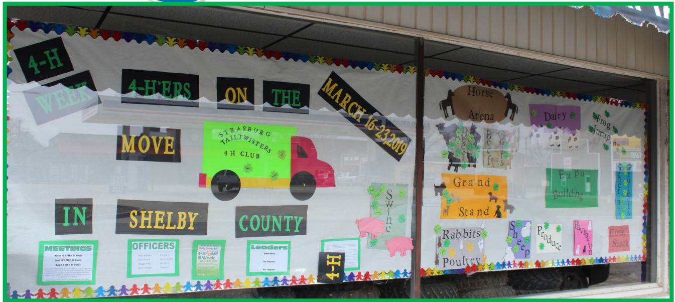
Strasburg Tailtwisters window display was named "The Best of the Best".