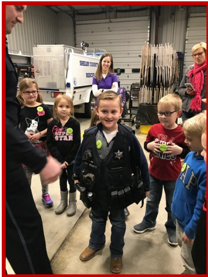
Shelby County Cloverbuds January Meeting "Those who keep us safe"