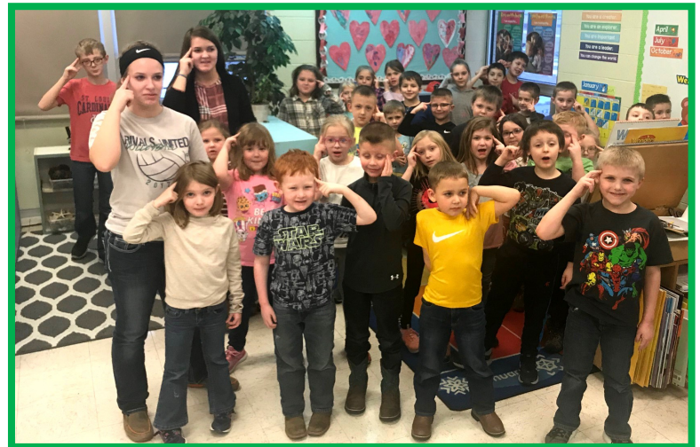
Stew-Stras Cloverbuds January meeting "Snow Much Fun:"