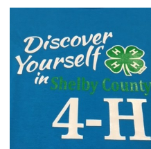
Exhibit your project in style with a Shelby County 4-H T-shirt. Federation has county 4-H and parent t-shirts available for sale. Sizes and colors vary. County shirts are sapphire and charcoal grey and parent shirts are navy. Youth to adult 2XL sizes are available. Cost is $10 or $12 for 2XL. Get your shirt by stopping by the Extension office. Shirts will also be available during the fair in the fair office, located in the east end of the Show Arena.