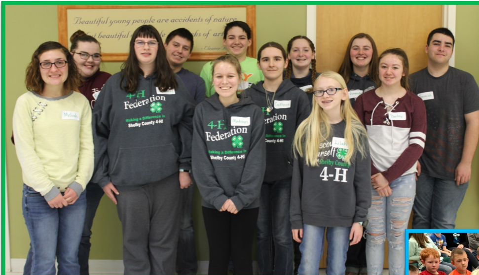
Federation Members attend Leadership Training