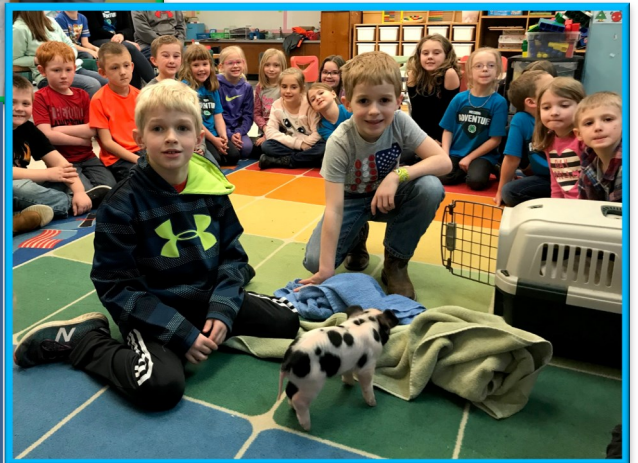
Stew-Stras Cloverbuds Holds "Valenswine" Themed Meeting