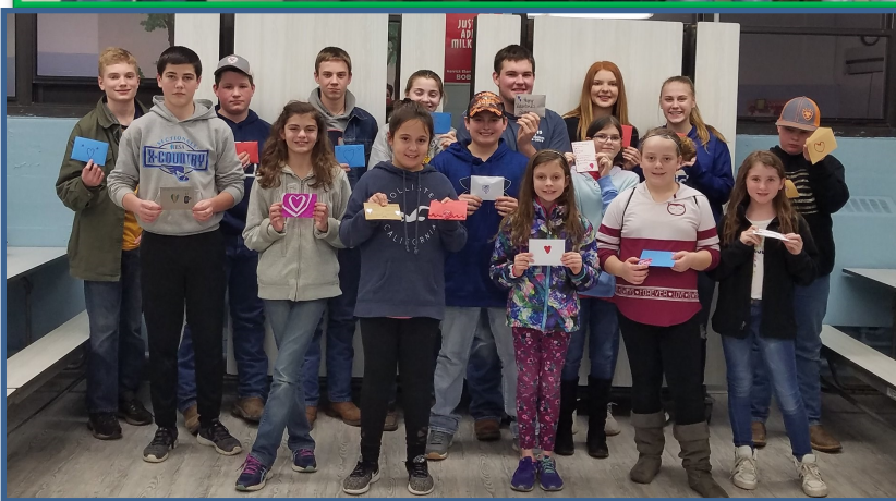
Coldspring Copperheads 4-H Club met in February and made Valentine's Day Cards for the Herrick Meals on Wheels Program.