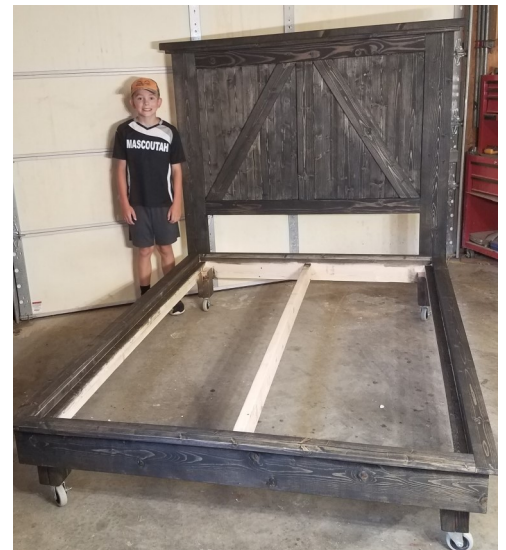
Morgan Waller Creative Critters Photography 2