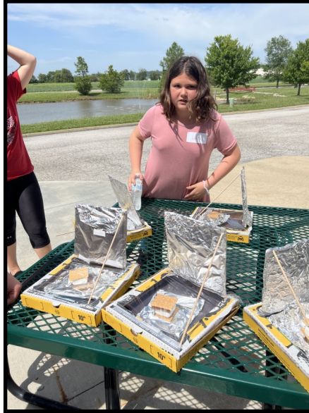
Solar Oven Smores