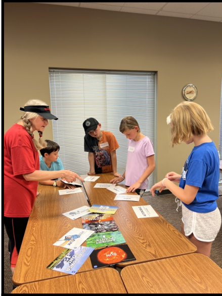
Riverbend Astronomy Club

We had a great week with everyone learning all about Earth's Natural Resources.