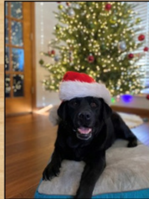
3rd Place Nicole R. New Ideal

Congratulations to our winners and all participants that submitted a Holiday Photo for the contest!