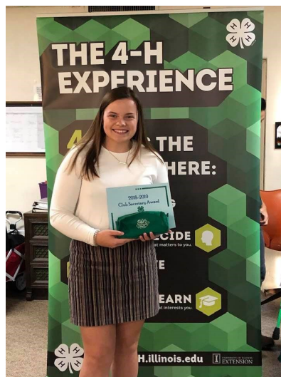
Top Club Secretary Record