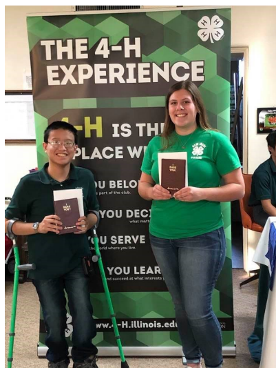
National I Dare You Leadership Award