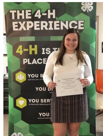
Illinois Holstein-Friesian Association Award