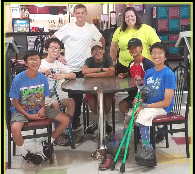
St. Clair County 4-H Ambassadors (several members pictured above) held their end-of-year celebration August 18, at the Bel-Air Bowl in Belleville. Members relaxed after a busy year promoting 4-H in St. Clair County.