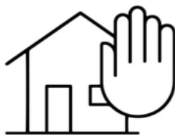
Stay home when possible