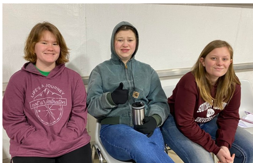
Photos from the Livestock Clinic.