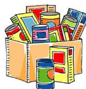
Feeding the Community

Thanks to the donations from the Trivia Night the blessing box at the GIFT Garden has been restocked. Remember The box is for anyone that needs a little assistance. Just like the note says "Take what you need, leave what you can!"