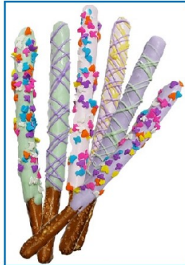
Chocolate Covered Pretzel Rods