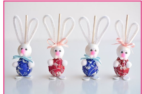
Tootsie Pop Bunnies