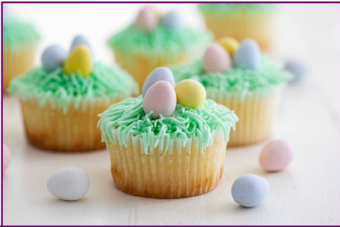
Robin Egg Cupcakes