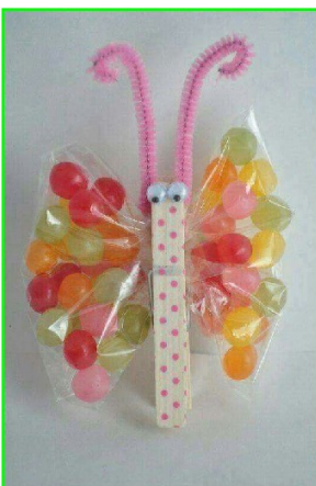
Jelly Bean Butterfly