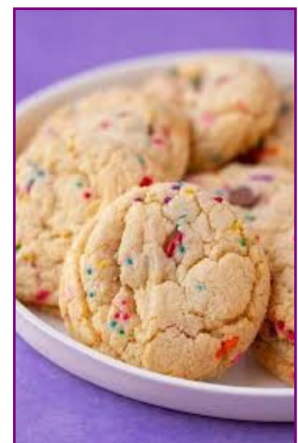
Cake Batter Cookies