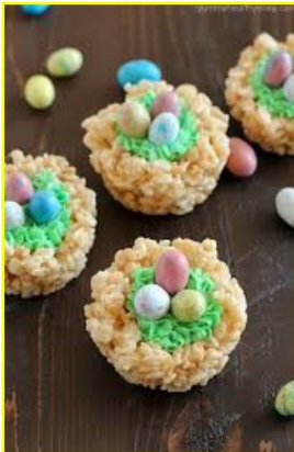
Robin Egg Rice Crispy Treats