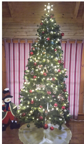
Lincoln & Emmaline Draper