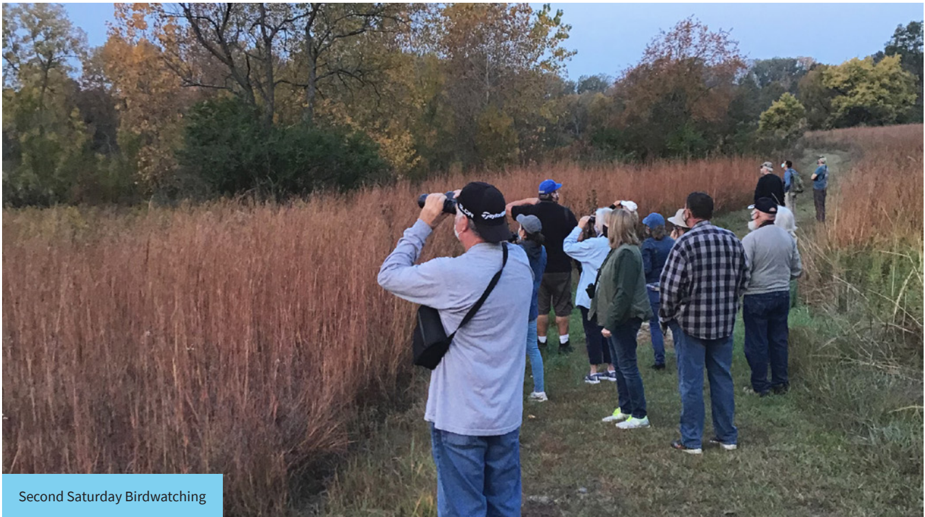
Second Saturday Birdwatching