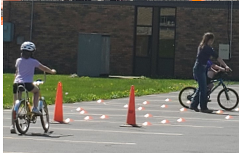
Winola Elementary School held a bike rodeo on May 1. The participants all had a great time!