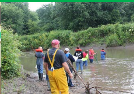
Mercer County 4-H Citizen Scientists study the Edwards River.