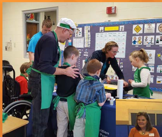
SNAP-Ed Community Workers teach people using or eligible for SNAP about good nutrition, how to make their food dollars stretch further and the benefits of being physically active.

SNAP-Ed Community Workers from Unit 7 also teach nutrition and wellness programs to youth and senior citizens at schools and through community partner agencies. In 2016, unit 7 Community workers visited 105 sites and directly worked with 23,257 youth (ages 5-17) and 8,106 adults.