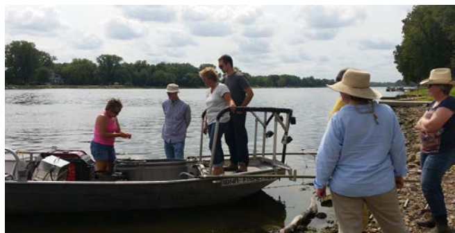
Master Naturalists do a fish sampling on the Mississippi River at Andalusia Harbor

Our four-county unit has 34 active Master Naturalists. They support the conservation, management, and interpretation of our region's natural resources.