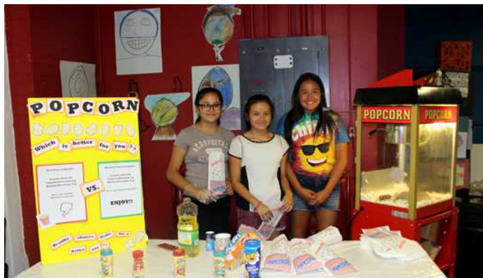
Teen Ambassadors at the Boys & Girls Club in Moline, IL presented a Health Carnival in July for their community.