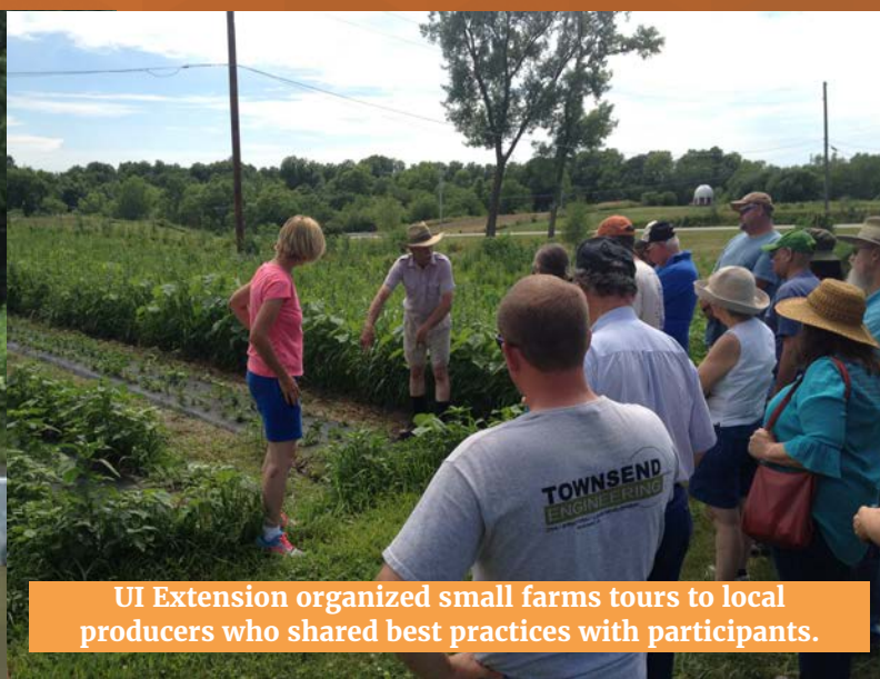
UI Extension organized small farms tours to local producers who shared best practices with participants.