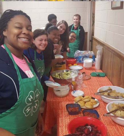
Rock Island County 4-H Teen Hunger Ambassadors are ready to welcome guests to one of their free monthly community meals.