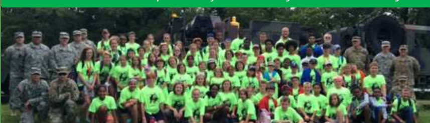
Youth of our hard-working Military Families enjoyed a week of summer camp and 4-H activities at Camp Abe Lincoln.