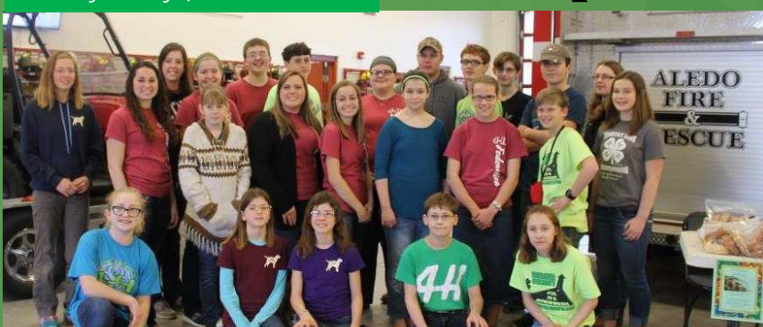
Mercer County 4-H members organized free community meals and educational PSAs to help address food insecurity in their community.