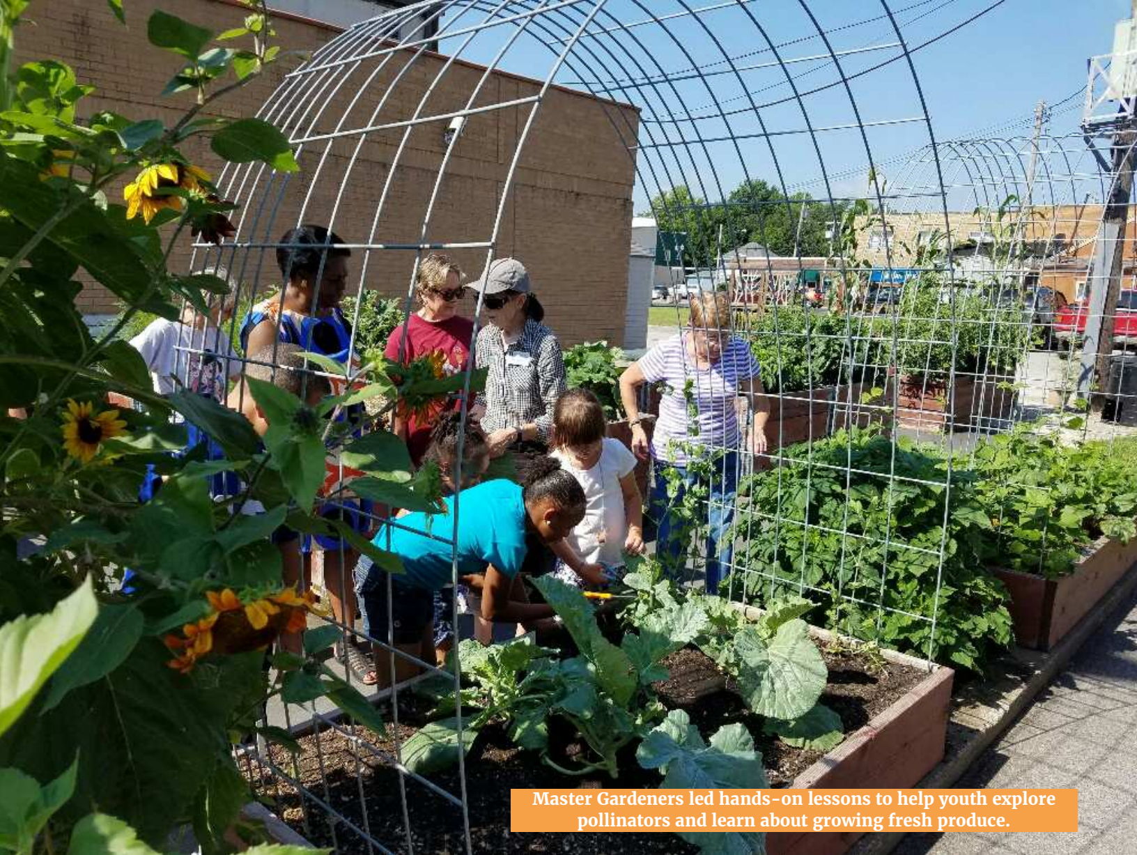
Master Gardeners led hands-on lessons to help youth explore pollinators and learn about growing fresh produce.