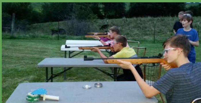
Mercer County 4-H Shooting Sports members exhibit the skills and mastery they learned over their 8 weeks of training.

Many area youth participate in our 4-H Shooting Sports program which covers archery, air rifle, shotgun and hunting/outdoor skills in all of our four counties. Most recently, three adults have been certified in the area of pistol. We now have twenty instructors and four county coordinators for our unit to offer this tremendous program. This past year over 250 youth participated in our shooting sports programs. It is one of the fastest growing programs in Illinois 4-H.