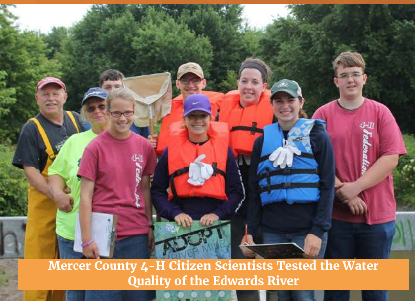
Mercer County 4-H Citizen Scientists Tested the Water Quality of the Edwards River