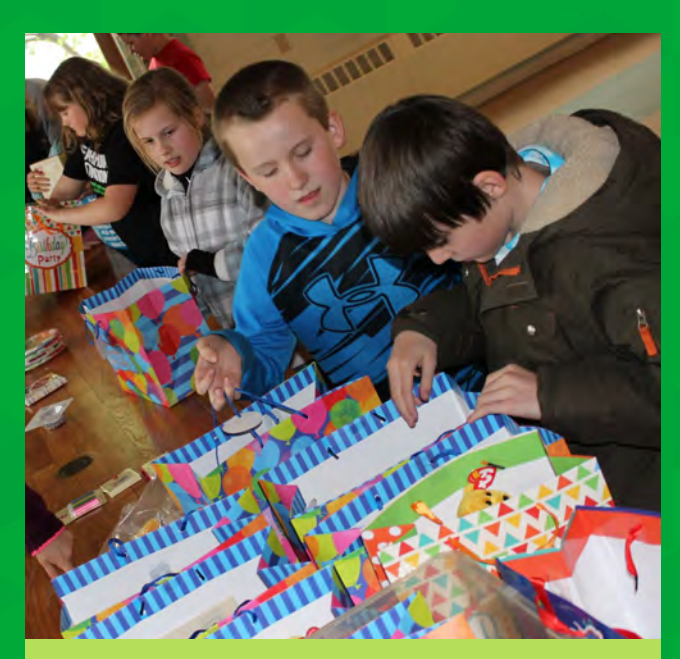
Nineteen DuPage, Kane and Kendall County 4-H Clubs collected birthday kit items for the 4-H National Day of Service. In all, they delivered 215 completed kits to various charitable organizations in the area.

In all, 4-H'ers delivered 215 birthday kits to 17 service organizations in the Fox Valley area, including: Addison Switchboard, Batavia Interfaith Food Pantry, Elburn Food Pantry, Elgin Crisis Center, Helmar Food Pantry, Hesed House, Elmhurst Walk-In Ministries, Loaves & Fishes, Old Second Bank of Elburn, People's Resource Center,