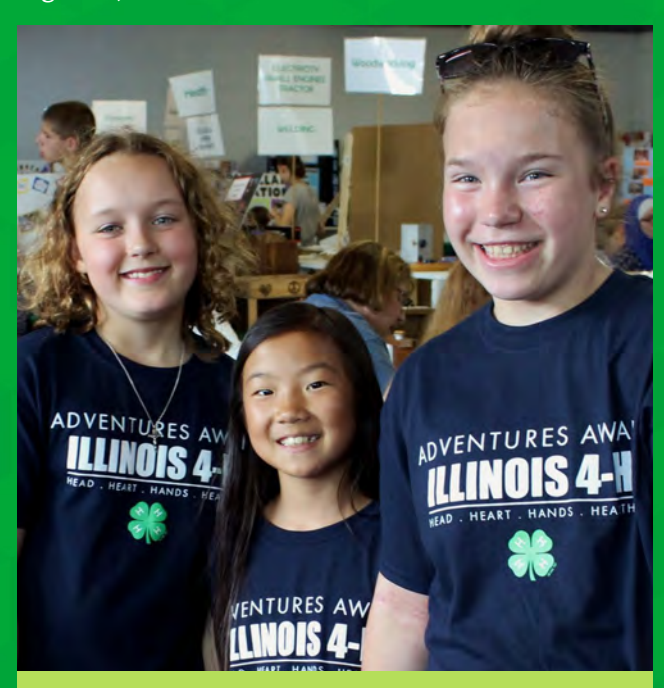
4-H youth learn about their projects, but also gain public speaking and other life skills.

Local 4-H Youth Development programs provide the opportunity for youth to feel a sense of belonging, develop independence, practice generosity, and experience mastery. They also open the door for youth to participate in amazing opportunities at the regional, state and national levels.