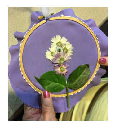
Indoor & Outdoor Projects