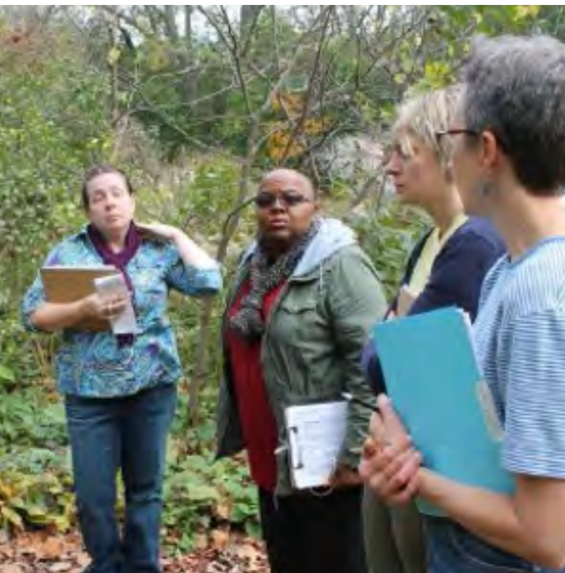
Master Gardeners and Master Naturalists evaluated a residential property for consideration of Conservation @ Home certification.

Further efforts to educate home gardeners on the principles of C@H, included staff and volunteers delivering six different programs at Forest Preserves of Cook County nature centers and publishing a quarterly newsletter.