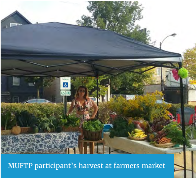
MUFTP participant's harvest at farmers market

We have an ongoing design for a new urban farm expansion. Thanks to the class we have updated the design to accommodate streamlining growing systems, modular set-ups and equipment. We hope to one day include a pack and wash farmstand.