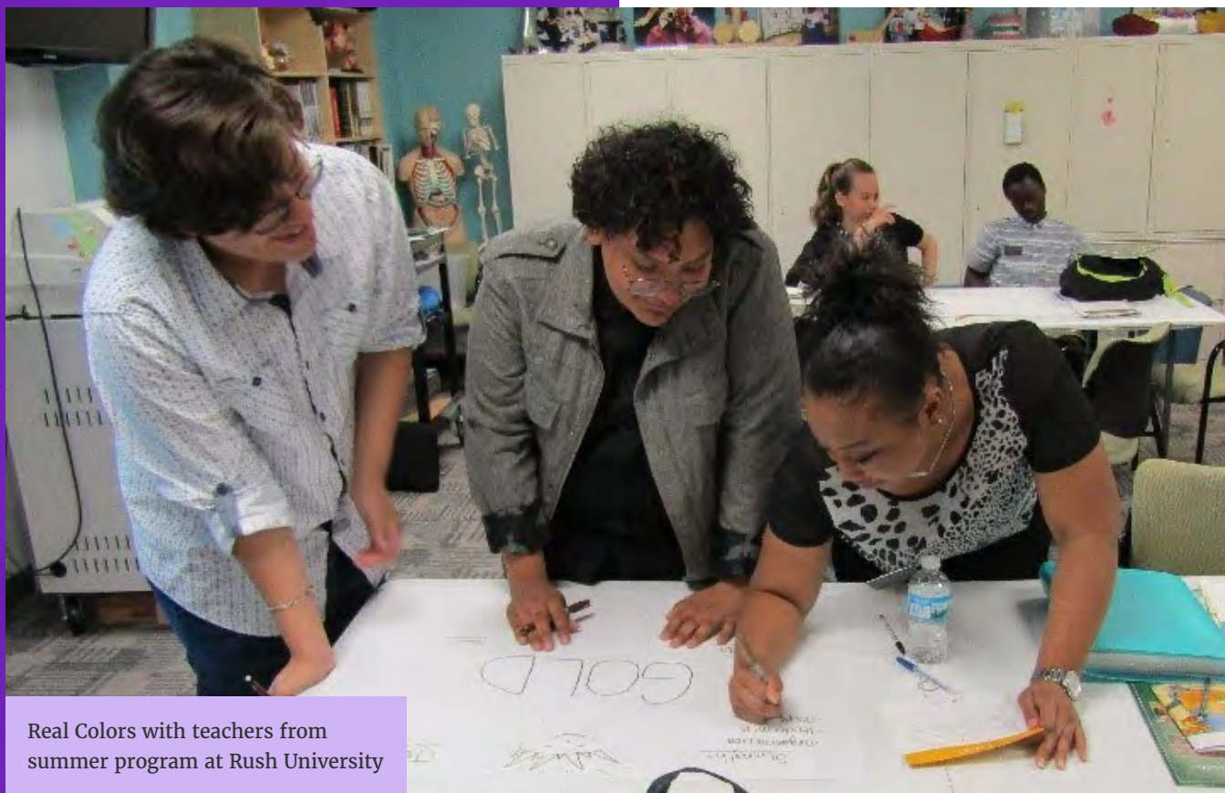
Real Colors with teachers from summer program at Rush University