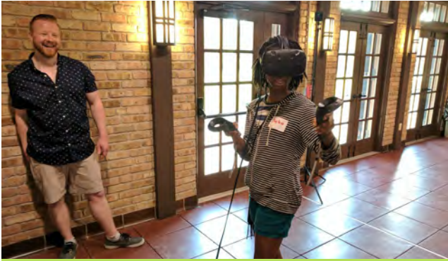
Campers used an HTC Vive or an Oculus Rift to do a virtual reality simulation of the International Space Station.