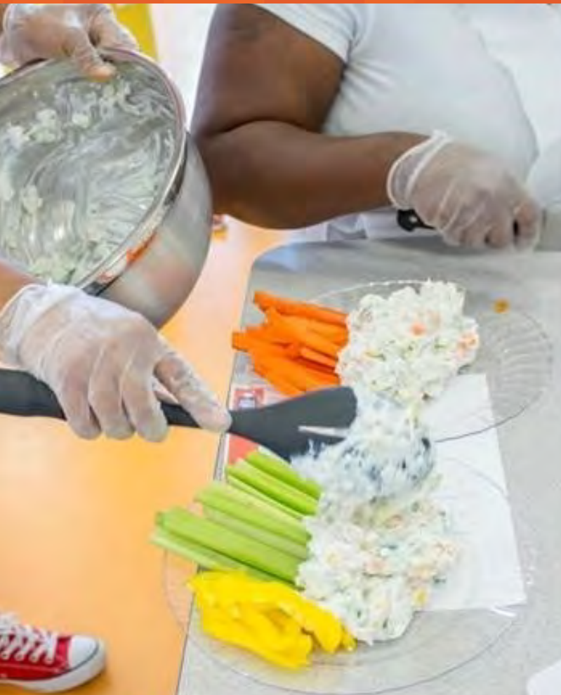
Providers prepare delicious and healthy meals at the Extension Healthy Habits for Tiny Tummies workshop.

Let food be thy medicine and medicine be thy food.