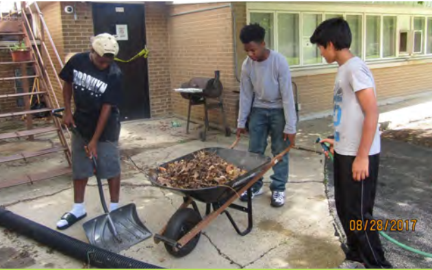
Girls and Boys Empowerment Community Service Project

On average, every dollar invested in SEL programs yields $11 in long-term benefits, ranging from reduced juvenile crime, higher lifetime earnings, and better mental and physical health. It essentially prepares youth and adults to achieve success and address challenges in school, work, and life. In Cook County, opportunities were made available that emphasized the development of the five core competencies of social and emotional learning: self-awareness, social awareness, self-management, relationship skills, and responsible decision-making.