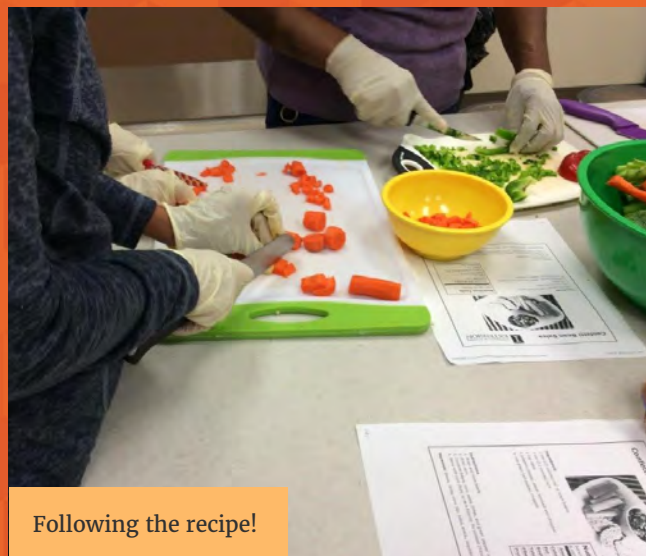
Following the recipe!