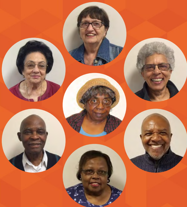
Learning is Timeless participants that attend Wits Fitness workshops monthly.

Extension’s goal is that participants will adopt long-term healthy behaviors to enhance mental performance and potentially delay the onset of cognitive decline, thus increasing their ability to age in place independently. This contributes to their overall physical and emotional health, thus helping them remain socially engaged and viable contributors to their communities longer. This further increases the generational and economic vitality of communities, and may delay the need and thereby reduce the costs of publicly-funded long-term care.