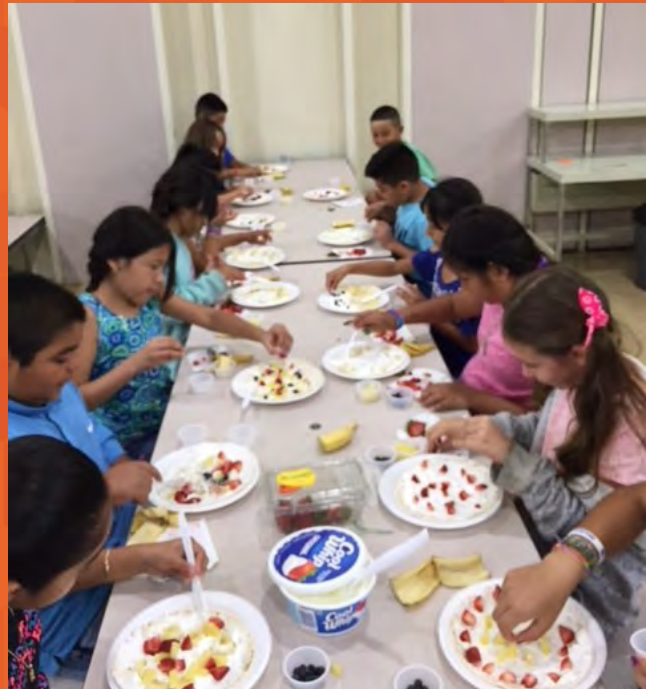
CATCH (Coordinated Approach to Child Health) after-school program kids are making a fruit pizza.

I made stir fry for the first time after learning to chop vegetables and it's all I cook now for dinner.