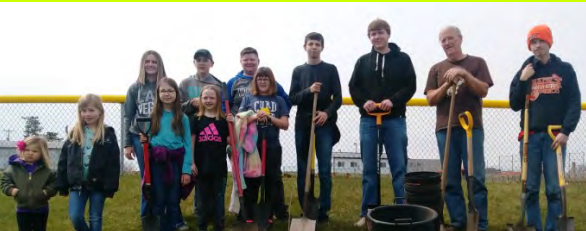
Stark planted trees at the high school in Toulon. Thanks to Al Curry and the Stark SWCD for all the help and information!