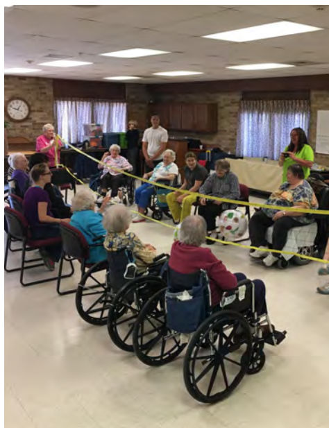
Teens at High Roads Alternative School in Aledo planned a healthy afternoon at the Aledo Senior Center and set up and played a beach ball volleyball game with them.