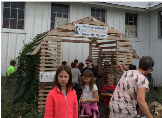
Apollo Elementary students visit to garden as part of Mercer County Extension's Ag in the Classroom pollinator lessons.

Master Gardeners in Mercer County earned the 2017 Illinois State Master Gardener Teamwork Award for their work to transform a perennial garden they maintained at the fairgrounds in Aledo into an outdoor pollinator classroom. Utilizing a grant from the Illinois Clean Energy Foundation, they installed genus-specific perennial pollinator plants so visitors could learn about various varieties and cultivars within a genus. The garden also is a teaching tool for learning about pollinators and what is needed for both butterfly caterpillars and adults. Master Gardener volunteers labeled the plants and installed a garden mailbox that holds garden maps and plant lists for self-guided tours. The garden has been used for horticulture outreach and Ag in the Classroom programs.