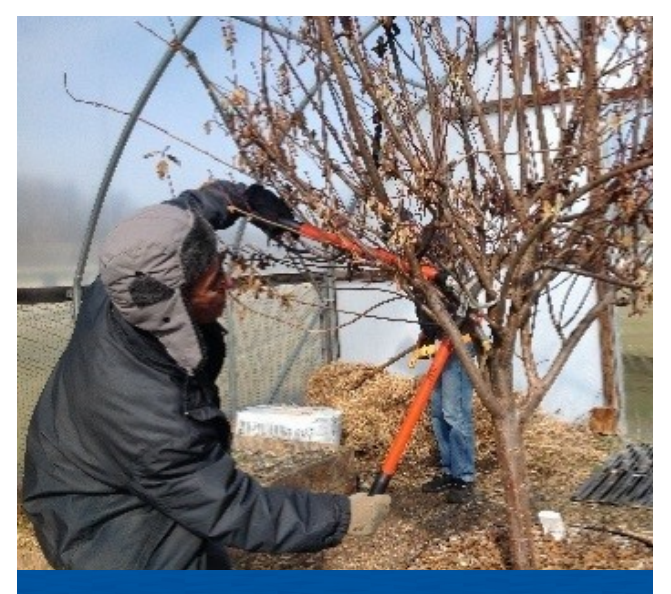
Pruning a fruit tree