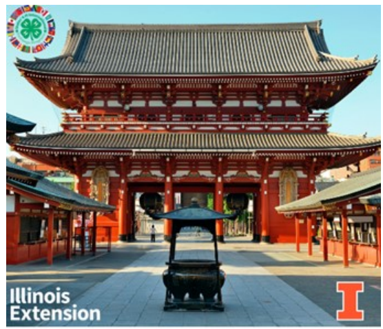
Travel Abroad Update!

National 4-H Council is now accepting presentation proposals from adult and teen presenters for the 2022 National 4-H Youth Summit (N4-HYS) on Agri-Science to be held in the Washington, DC area, March 10-13, 2022. High school-aged youth are immersed in an agenda focused on agricultural science, food security and sustainability. Sessions will demonstrate why and how agriscience is important and how young people can become changemakers. Find general conference information at <a href="https://4-h.org/parents/national-youth-summits/">https://4-h.org/parents/national-youth-summits/</a>. Full details available here and submissions are due by October 3<sup>rd</sup>!