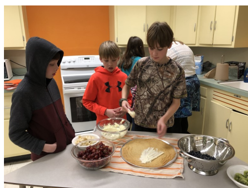
Making fruit pizza