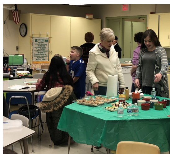
Parents and grandparents attending a tasting