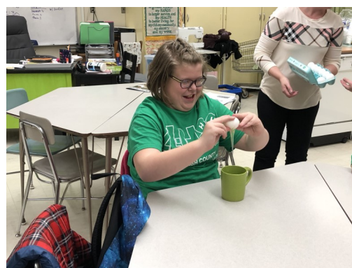
Learning to separate egg whites