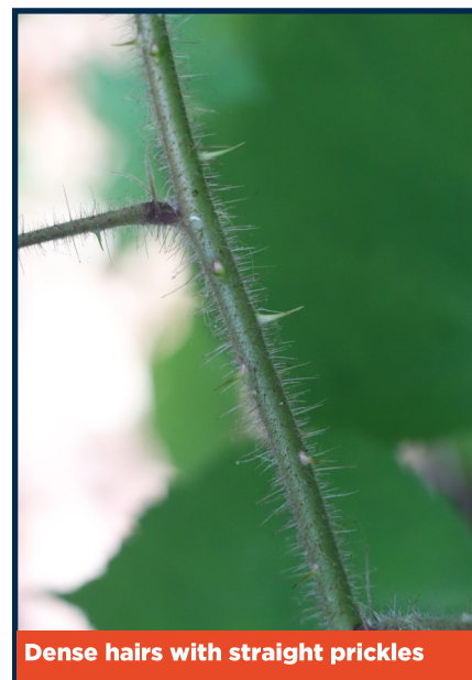
Dense hairs with straight prickles