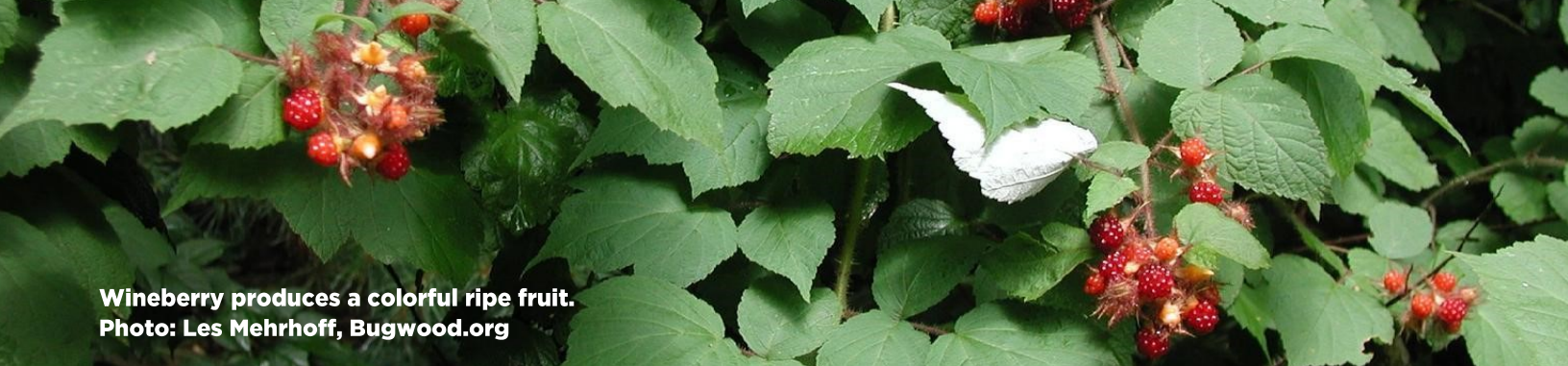
Wineberry produces a colorful ripe fruit.