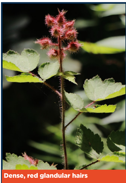
Dense, red glandular hairs