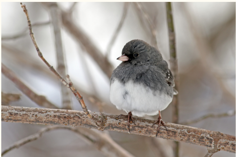
Dark Eyed Junco, ( Junco hyemalis )