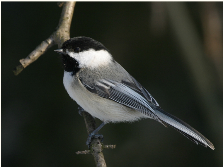
Black-capped Chickadee, ( Poecile atricapillus )