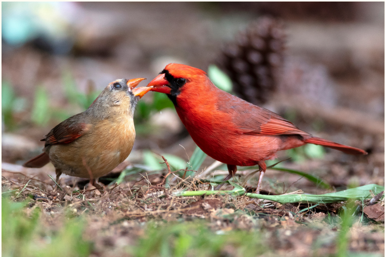
Northern Cardinal, ( Cardinalis cardinalis )